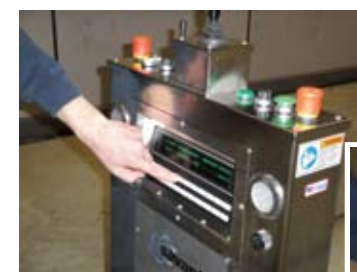
▲ Onboard or remote destination selection

616-791-8540 (choose option 1 for sales) sales.dept@savantautomation.com