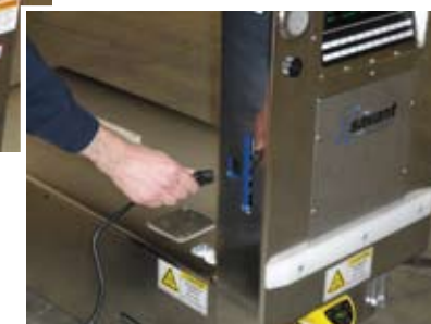
110V AC plug-in or automatic charging ▼